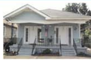
1208/1210 S. GENOIS

IMMEDIATE CASH FLOW. Property is currently getting $1800 rent, potentially more. Gutted after Katrina, renovations completed in 2006 include new roof, dry wall, and wiring, 2 new central heaters installed since 2006. Long term tenants, excellent return on investment. Close to the Blue Plate Mayonnaise Building. $125,000